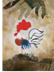
Mr. Rooster 2009