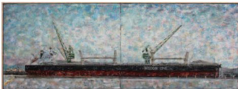
“trip to...” Vol.6 Kobe, Japan “Tanker” / P20号×2(1454×530mm) 2015