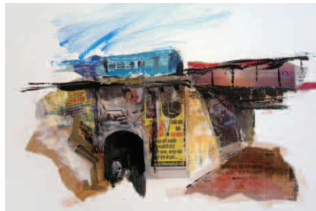
“trip to...” Vol.2 India 2010