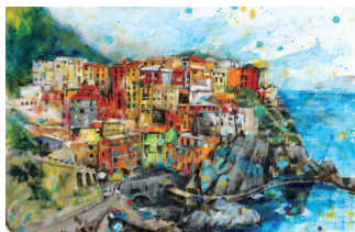
“trip to...” Vol.1 Italy2 2013