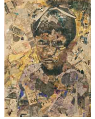
Nepali boy 1998