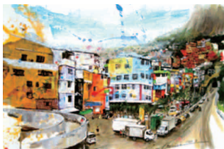
“trip to...” Vol.4 Brazil 2012