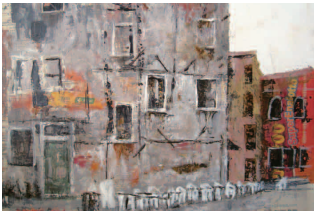
“trip to...” Vol.1 Italy 2009